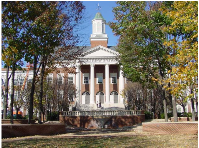
The Albemarle County Office Building

This publication is part of a series of informational materials prepared by the students of the Albemarle County Adult Education Web Project . The Web Project was made possible through an English Literacy/Civics Grant awarded by the State of Virginia Department of Education. The information contained herein is intended for general informational purposes and guidance. Mention of a particular institution, vendor, or service does not imply endorsement on the part of Albemarle County or Albemarle County Schools.