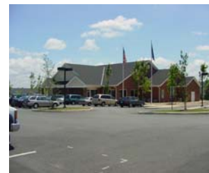
The Charlottesville-Albemarle Department of Motor Vehicles 2055 Abbey Road Charlottesville, VA

the punishment. In many cases, this decision can be appealed . This means that the case can be presented to another, higher, court. The legal system in the United States is very complicated and it can be a frightening experience to be involved in a trial. The most important thing to remember is that in the U.S., you are innocent until proven guilty. You do not have to prove that you are innocent...the government has to prove that you are guilty. If you are charged in a criminal case and you cannot afford your own lawyer, one will be appointed for you. Translators should be available to you so that you can understand the questions and proceedings in court.