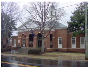
The District Court