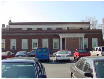
The Albemarle County Police Department