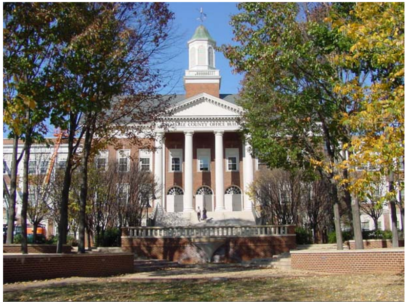
The Albemarle County Office Building

This publication is part of a series of informational materials prepared by the students of the Albemarle County Adult Education Web Project . The Web Project was made possible through an English Literacy/Civics Grant awarded by the State of Virginia Department of Education.