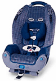
Child Safety Seat

For more information on Child Safety Seats, visit the National SAFE KIDS Campaign website at www.safekids.org